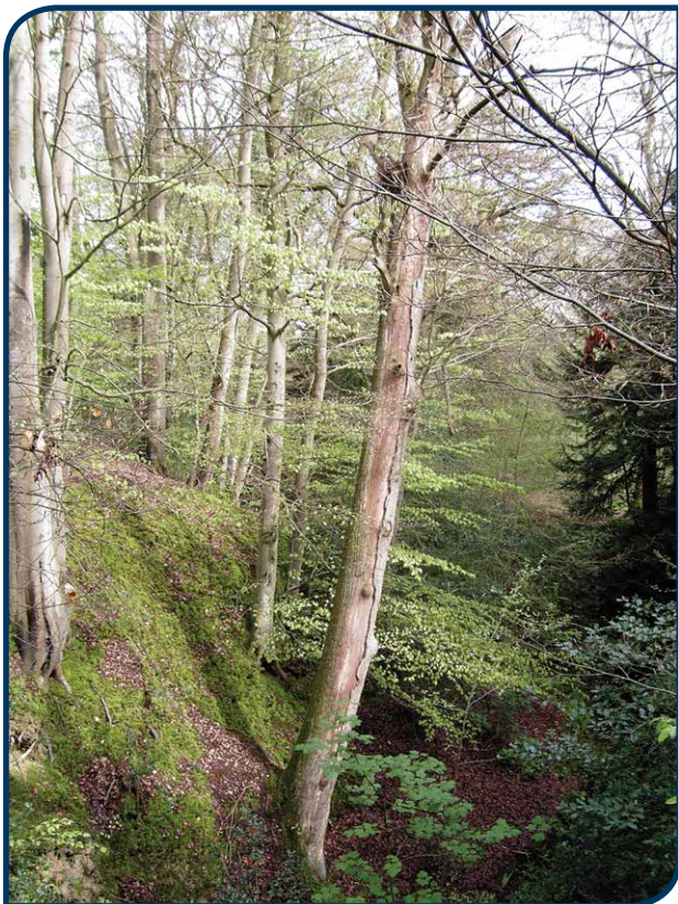
Crossing a deep High Weald Ghyll