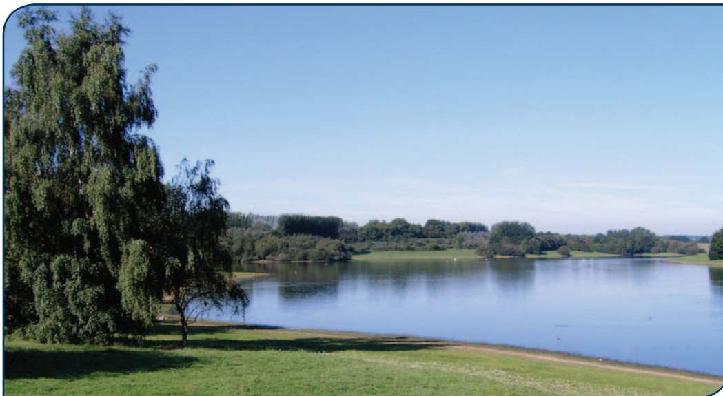
A view across Bewl Water