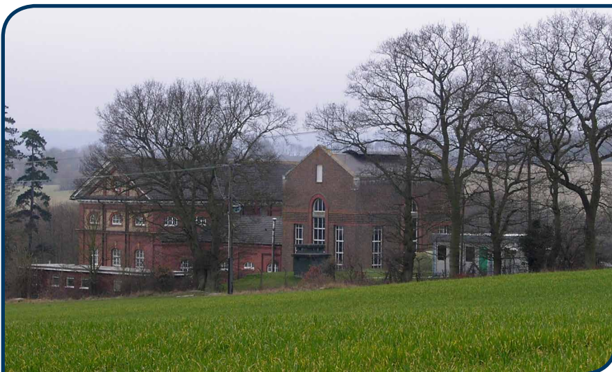
A view of Brede Valley Waterworks