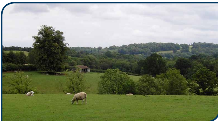
View from the route near Lightlands