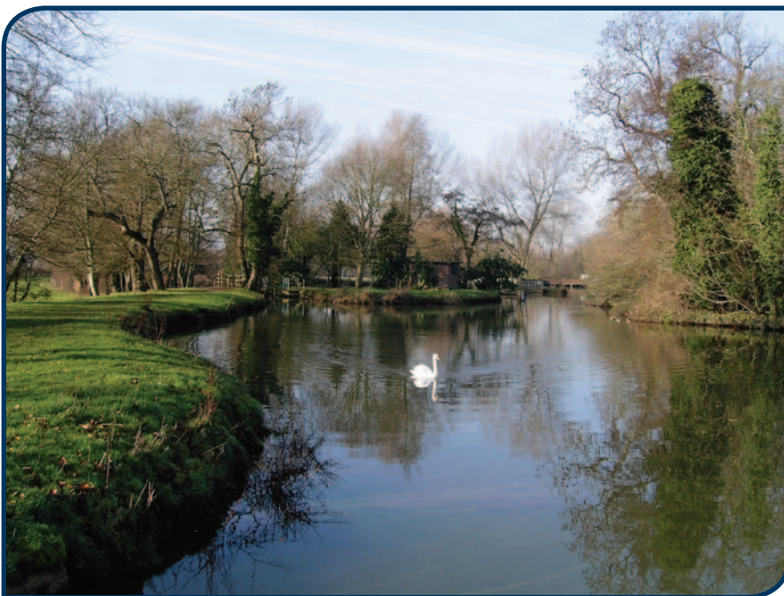
Swan on the river above Barcombe Mills