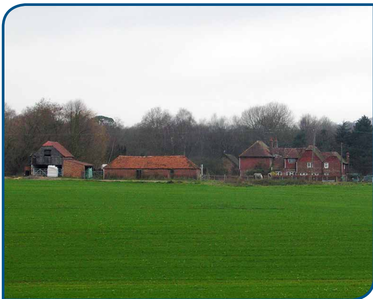
View towards Old House Farm