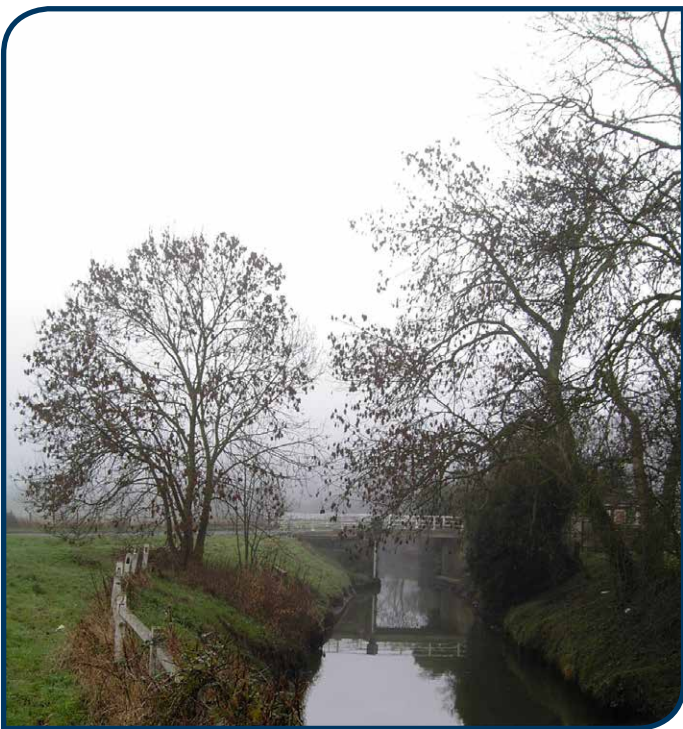
View along the River Brede