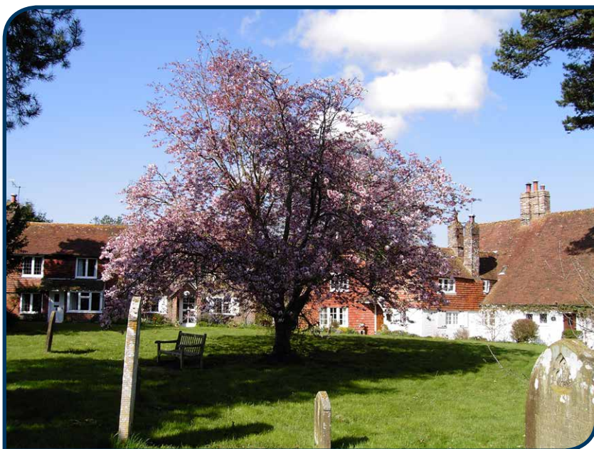
The Churchyard, Hellingly