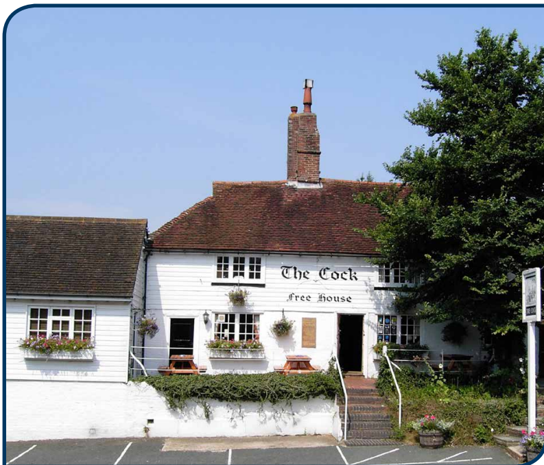
The Cock Inn, Wellingham