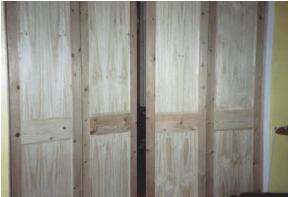
Panel doors made from reclaimed timber