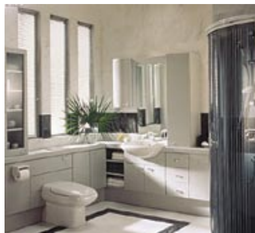
Above R: Bathroom units made from Medite Below R: Medite board close up showing grain Below: A table made from Medite

Contact: Weyerhaeuser Europe Ltd: Tel: 01702 619044 www.weyerhaeuser-europe.com