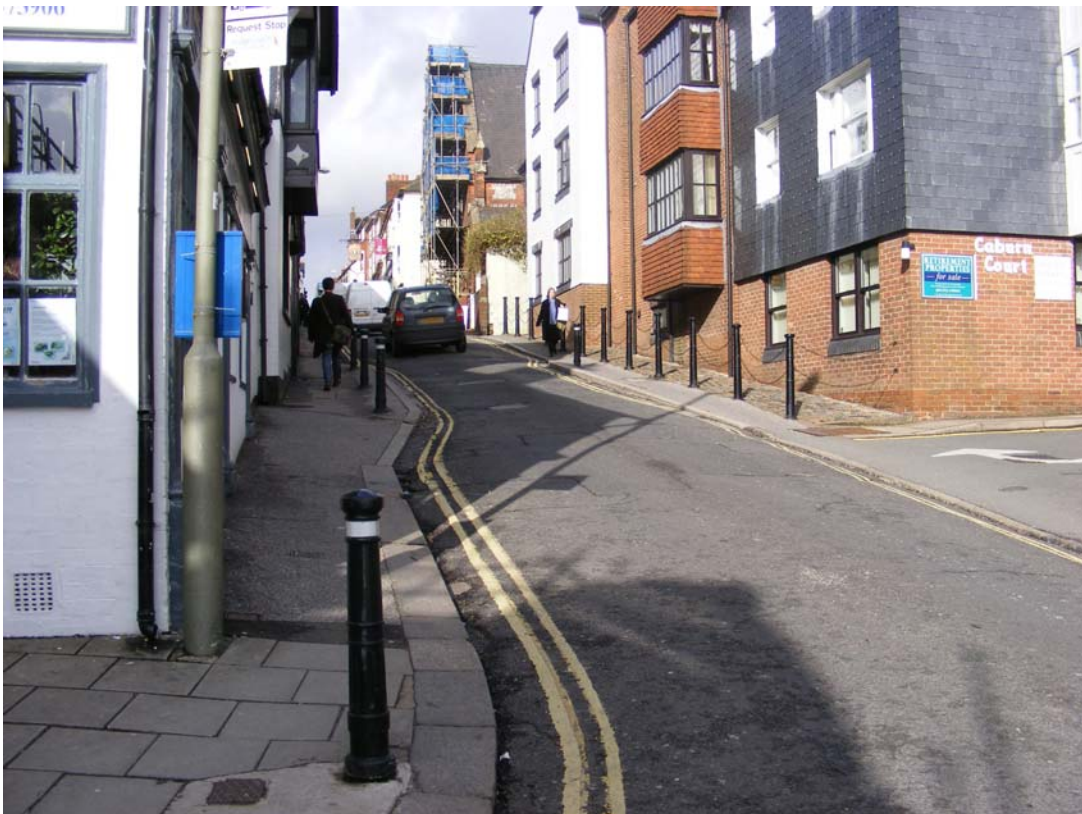
B2123 Station Road – Looking North at Caburn Court