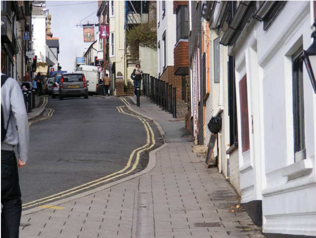
B2193 Station Street – Looking North from Lansdown Place