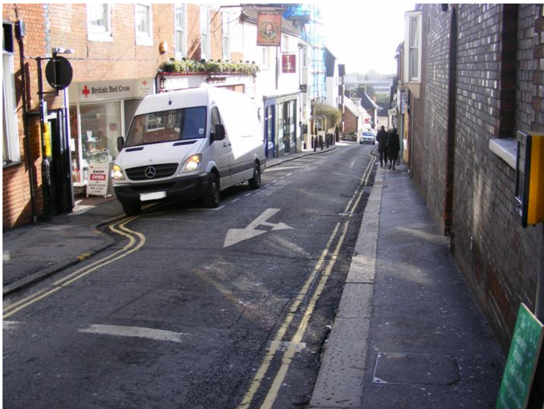
B2123 Station Road – Looking South from the High Street