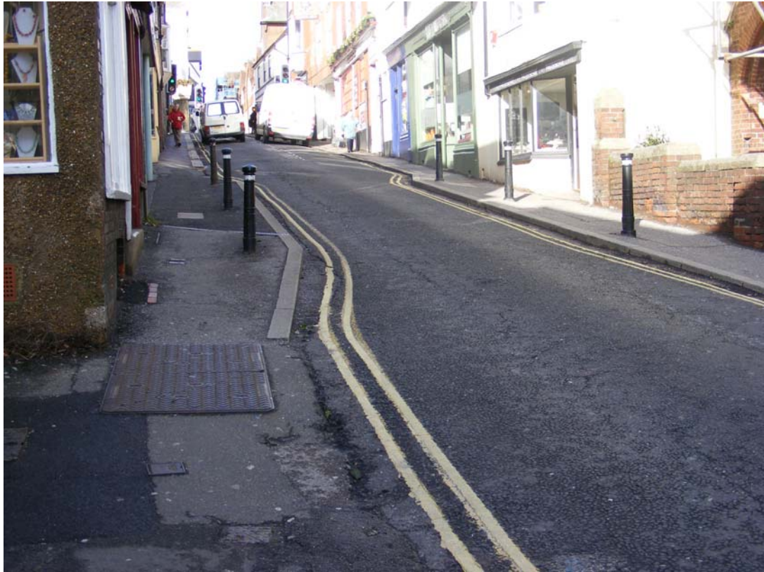
B2123 Station Road – Looking North at Marlborough Place