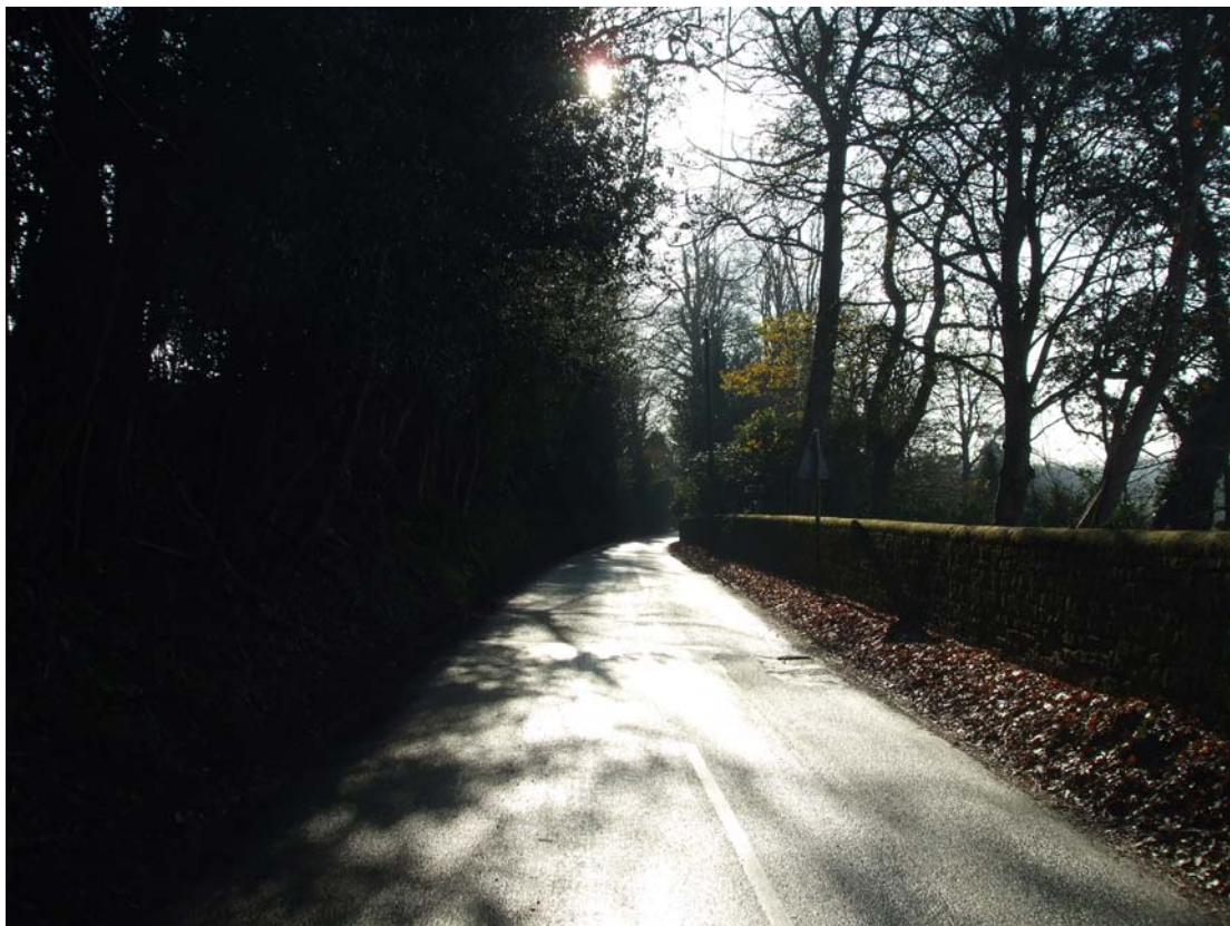
View for southbound vehicles south of Fliterbrook Lane. No verge on east side, limited verge on west side.