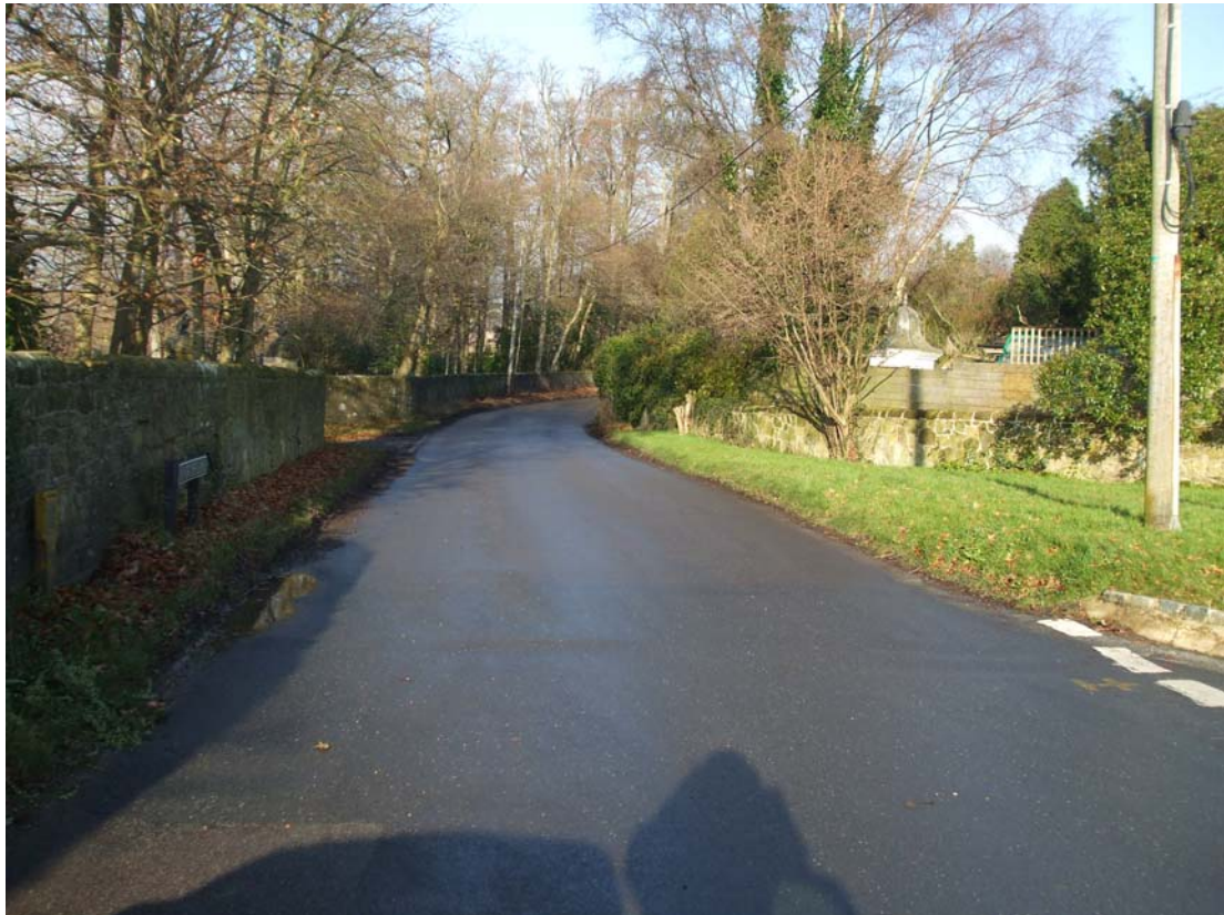
View of commencement of proposed speed limit on Marklye Lane facing southbound vehicles in top photo and view facing northbound vehicles in bottom photo.