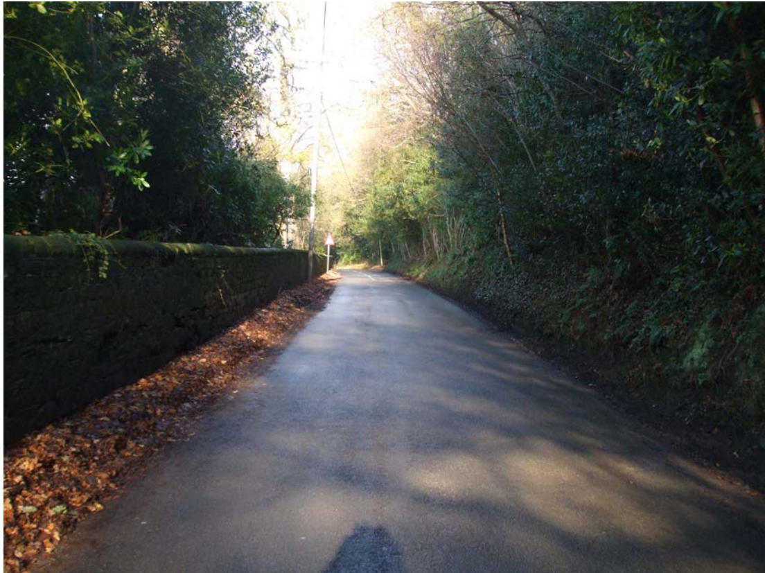
View facing northbound vehicles north of “Lantinning” and “Rookswood”. Limited verge on west side and no verge on east side.