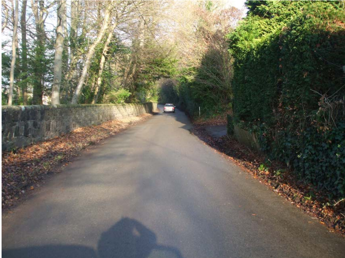
View of “Lantinning” and “Rooksbrook” on right hand side facing northbound vehicles