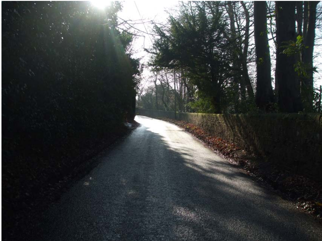
View for southbound vehicles on approach to “Lantinning” & “Rookwood”