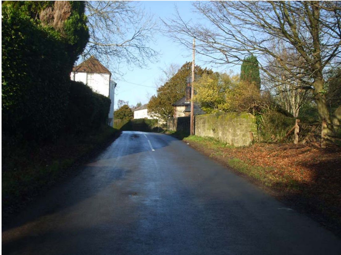
Commencement of proposed speed limit in Back Lane above and Middle Lane below