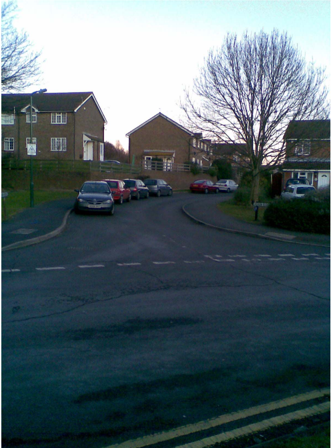
Photograph looking into Heron Ridge